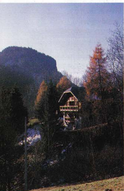
above With one giant airy room for dining, cooking and lounging, the first floor is the chalet's hub left The two-storey building has views across the valley and Les Gets to the peaks of the Portes du Soleil